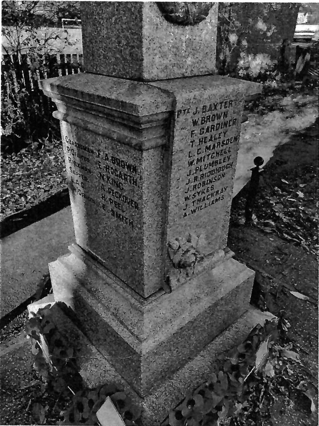
Upon inspection of the lettering which is flush lead letters painted black, the letters are all intact and no discoloration of the paint.